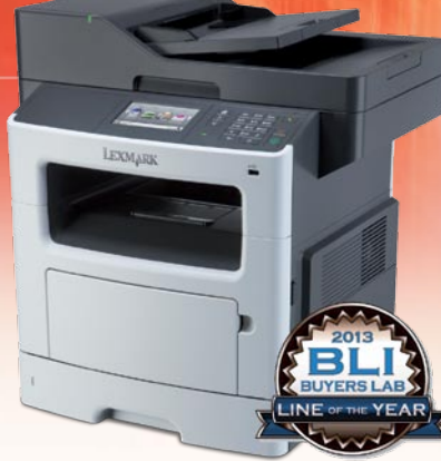
Up to 42 ppm