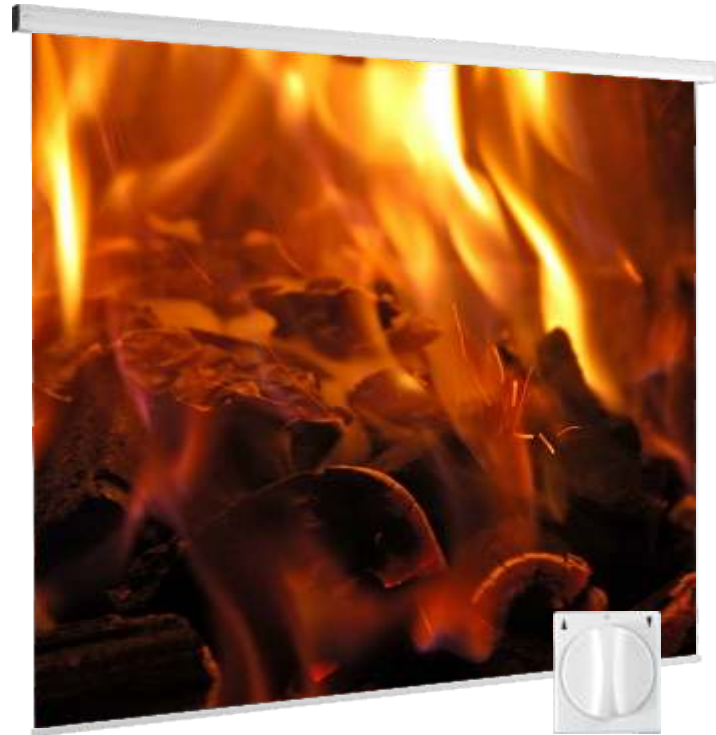
BASIC EQUIPMENT: MANUAL WALL SWITCH