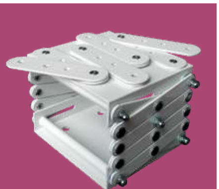
PROJECTOR CEILING BRACKET (SET VERSION)