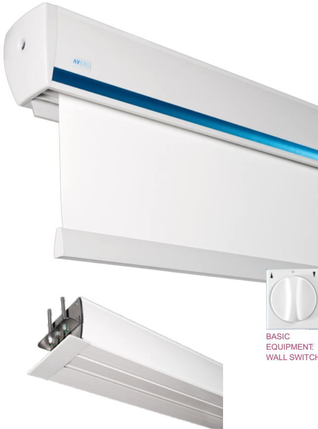
BASIC EQUIPMENT: WALL SWITCH