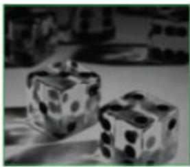
2000:1 Contrast Ratio

Bright 2600 ANSI Lumens, Perfect for projecting in lights on environments. And with DarkChip3™ technology from Texas Instruments combined with Eco+ technology produces a stunning 13,000:1 contrast ratio for pin sharp graphics and crystal clear text. Crisper whites, ultra-rich blacks make images come alive and text easier to read - ideal for business and education presentations.