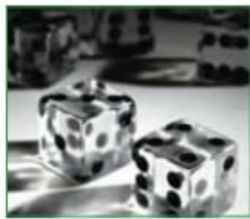
13,000:1 Contrast Ratio